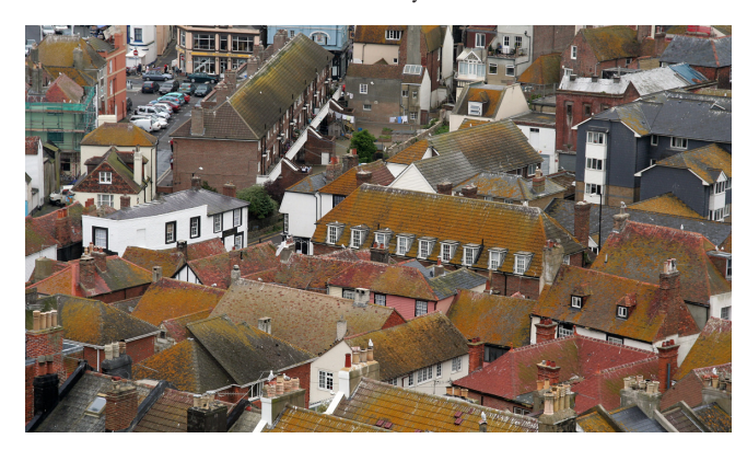
Large and small Local Authorities across the country have selected LAMP to modernise their spatial data and service delivery systems

For more information about LAMP, and a no obligation review of how a spatial information modernisation project could benefit your Local Authority, please contact the undersigned below.